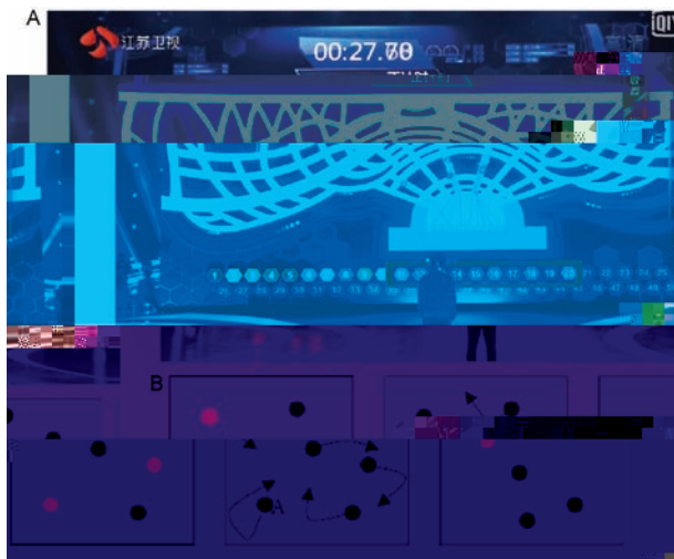
3 ”(A) [25](B)( )

(distractor item). 7~15 s. ( 3B). capacity). 15 min 50 50 (visual attention) (multifocal attention), [24]